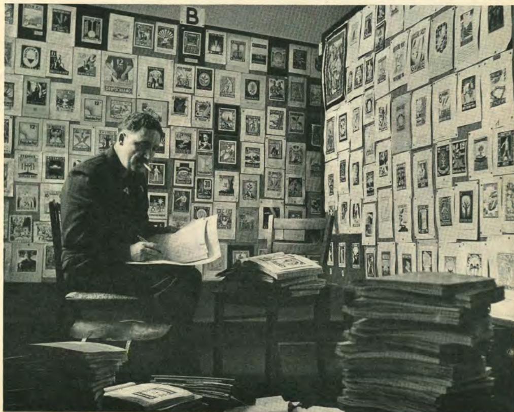
SURROUNDED BY DESIGNS. U.S. judge, G. C. Shepler, works on selections. Of five designs above which were finally chosen, one set of stamps was printed for each of Big Four nations and a fifth for Germany. These will rank with world's rarest stamps because those issued for actual postal use will have different colors and denominations.