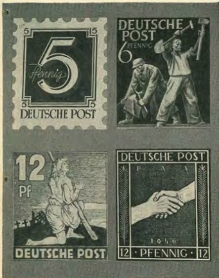
ORIGINAL FIRST CHOICES were rejected because judges could not agree. U.S. wanted simple design at top, left. Russia liked one at top, right. British favored stamp at lower left. French were enchanted by clasped-hand design.