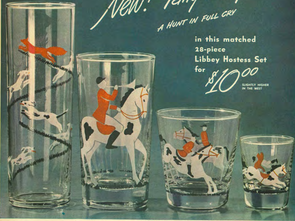
4 types of party glasses, each with its own colorful hunting print. Gay, charming, original!

Now featured at leading stores—these talk-making party glasses created by one of America's leading designers! Just in time for your holiday entertaining! Safedge rims are guaranteed on