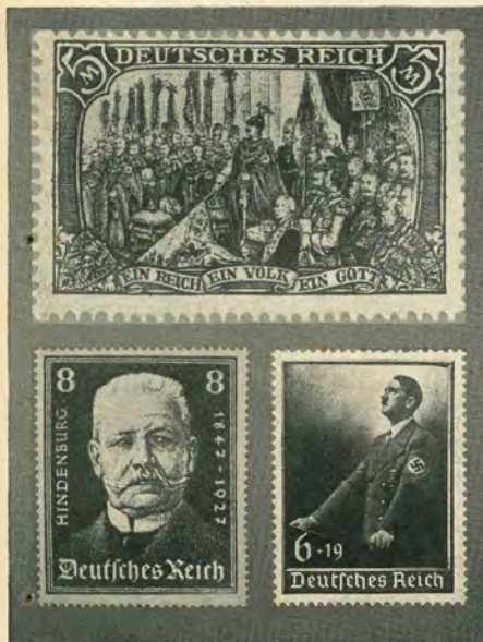
OLD GERMAN POSTAGE STAMPS reflected strong nationalism, ranged from a 1906 Kaiser Wilhelm II issue (top) through 1927 Hindenburg issue (bottom, left) to a 1939 Hitler stamp for National Labor Day (bottom, right).