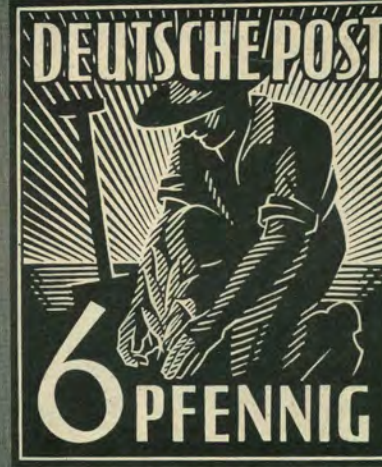
THESE ARE THE FIVE WINNING DESIGNS. GRAND PRIZE WINNER (CENTER) WAS A FIRST CHOICE OF BRITISH, SECOND OF U. S. AND SOVIETS, SOLE EXCEPTION TO PEASANT AND WORKER MOTIFS WAS THE PEACE-DOVE DESIGN WHICH WAS FIRST CHOICE OF U. S. AND FRENCH AMONG FINAL WINNERS, LAST CHOICE OF SOVIETS