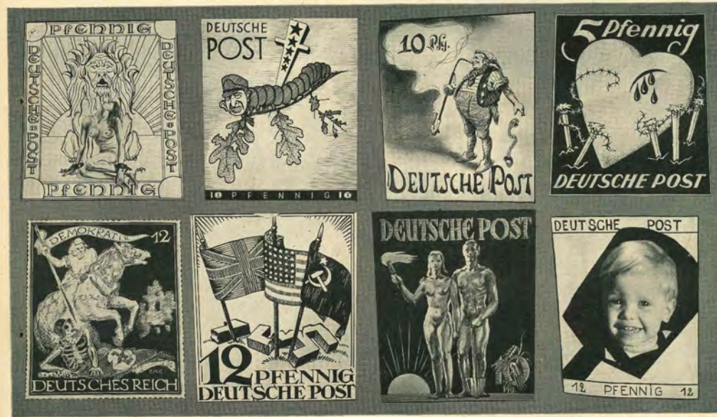
LOSING ENTRIES included many weird designs like the British lion (top strip, left) crouching over a nude, who is supposed to represent a tamed and liberated Germany;

plunged for the traditional worker wielding a hammer. By last month the weary judges had announced five compromise winners (above), ordered stamps printed from them for general distribution. None of winners pleased all the judges, who still hoped their compromise choices would keep everybody happy.